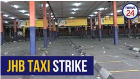
WATCH | Commuters, including health workers, left stranded by taxi strike