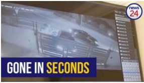
WATCH | Gun-wielding men hijack vehicle and abduct driver in less th...