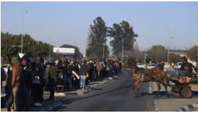
KYK: Hoe kom ons by die werk?