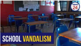
WATCH | 28 new incidents of vandalism, theft and break-ins...