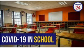
WATCH | 38 Gauteng schools have reported Covid-19 cases, says...

"He was a good guy and loved children and his friends."